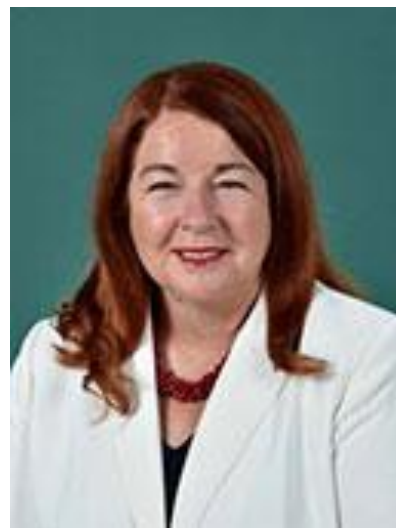
The Hon Melissa Price MP