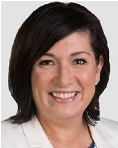
Hon Leeanne Enoch Quandamooka Women