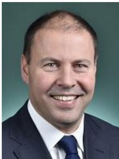
Hon Josh Frydenberg MP